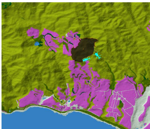
Figure 1 Toolkit wildfire simulation of Los Angeles

Curate your firefighting fleet; from detection to suppression, teams will be given the chance to design the System of Systems (SoS) from the ground up. Fleet composition, suppression tactics, aircraft specific operations and more are all modifiable! Put your engineering skills and ingenuity to the test with the SoS Xploration Grand Challenge. Enhance the COLOSSUS SoS in a set of 3 scenarios, ranging from an island in Greece, to the French Alps and Californian countryside. Explore, test and validate aerial wildfire fighting aircraft concepts with a provided toolkit (Figure 1) where each scenario is defined and simulated.